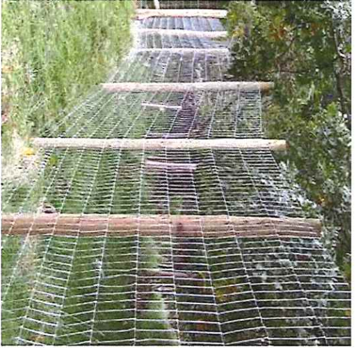
Deer Fence Image