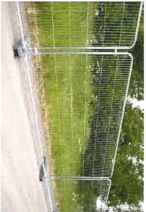
Heras Fence Image